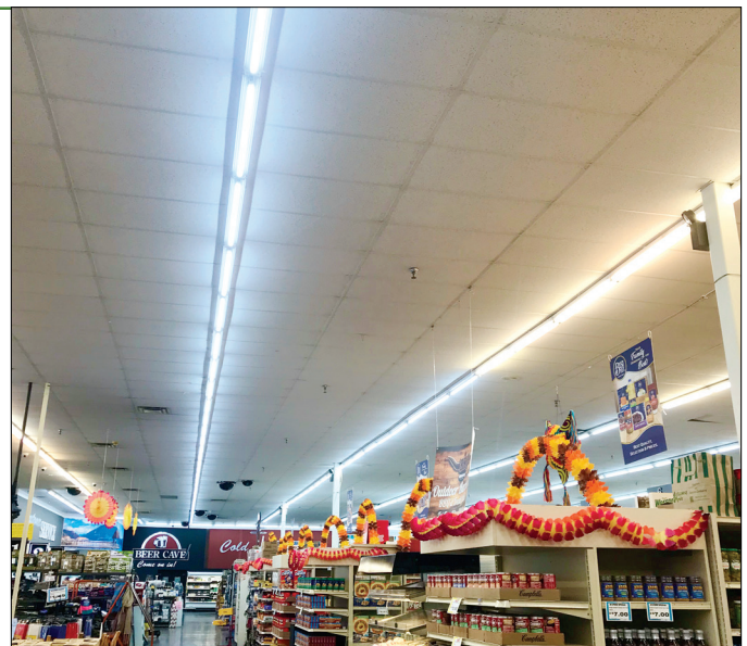
Partially completed retrofit