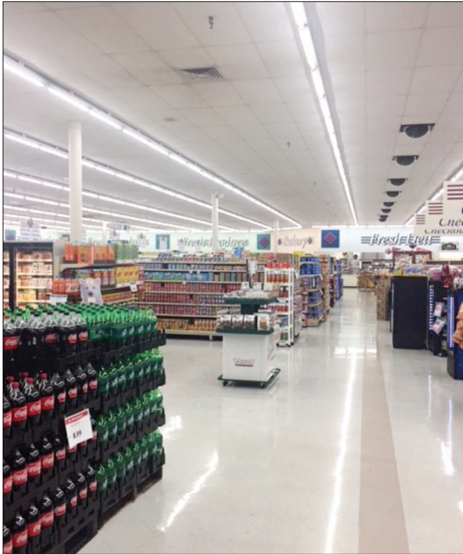
45% FC Increase 55% Electricity SAVINGS!